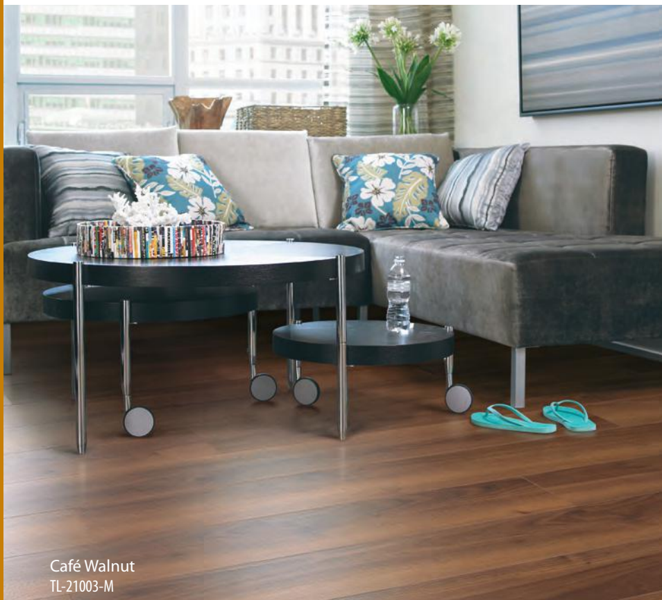
Café Walnut TL-21003-M

The contemporary and inspired look of nature's exquisite woods.