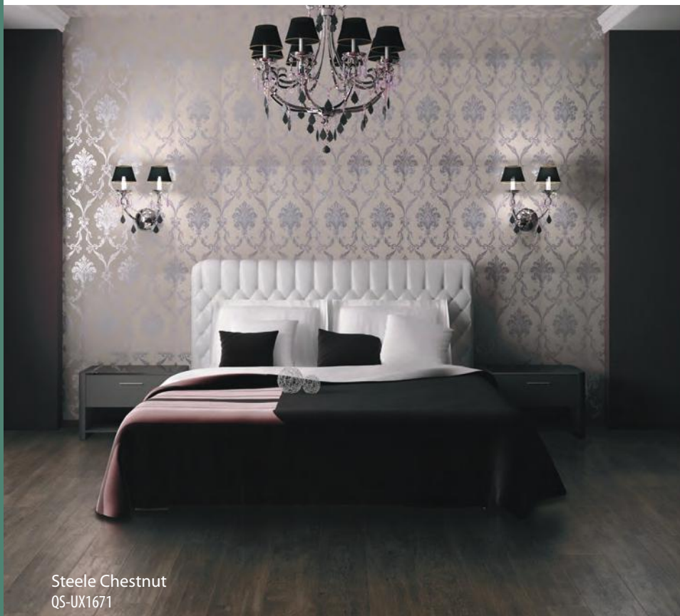
Steele Chestnut QS-UX1671

Unmatched realism is achieved through beautiful scraped textures.